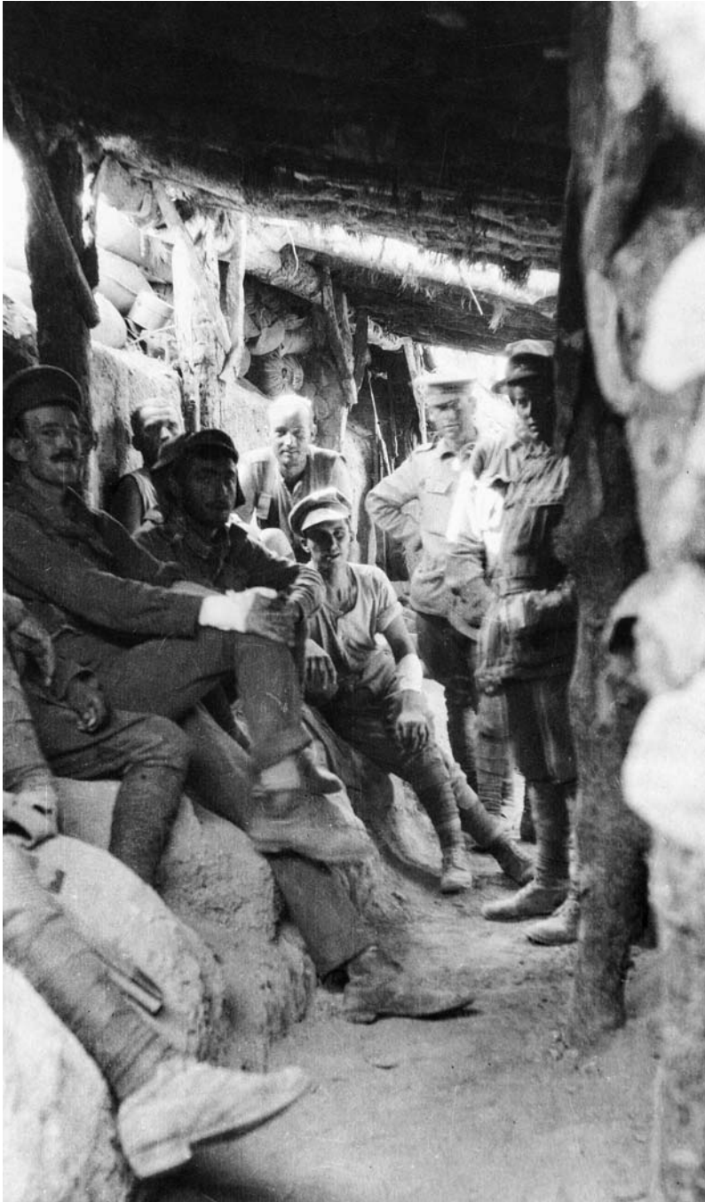
AWM G01126. Australian troops relax inside a captured Turkish trench at Lone Pine. The effect of our howitzer shells on the heavy head cover of pine logs—the breaking through of which in taking Lone Pine was the great difficulty—is shown.