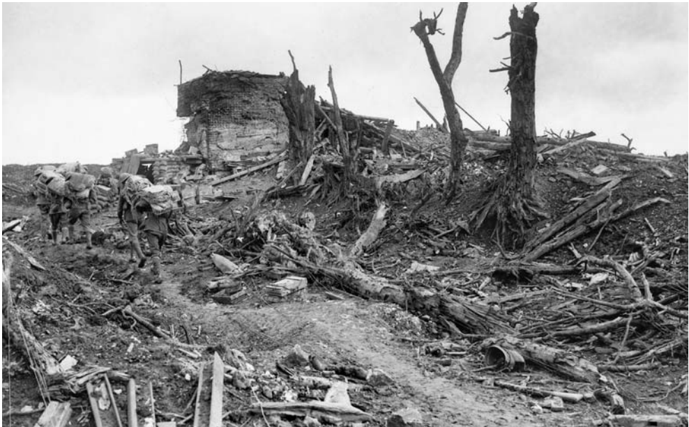
An Australian fatigue party from the 7 th Brigade (far left) carrying piles of empty sandbags to the front line through the devastated area near Pozieres. The structure on the left is the remains of a German observation post, which stood on the western end of the village and was nicknamed 'Gibraltar' by the Australians.

Many a Digger said, 'If there was a hell on earth, then Pozieres was it'. The Australian sector occupied an area a little less than two kilometres square. The Germans had their corps artillery—a thousand guns in all—ready and waiting to pound the Australians into the ground, which they did relentlessly for more than a month.